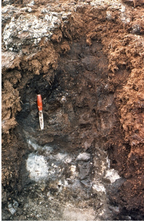
Fig. 3. Example of perennally frozen organic soil (Histel) developed on moss peat with a high ice content (white areas) in the subsoil.