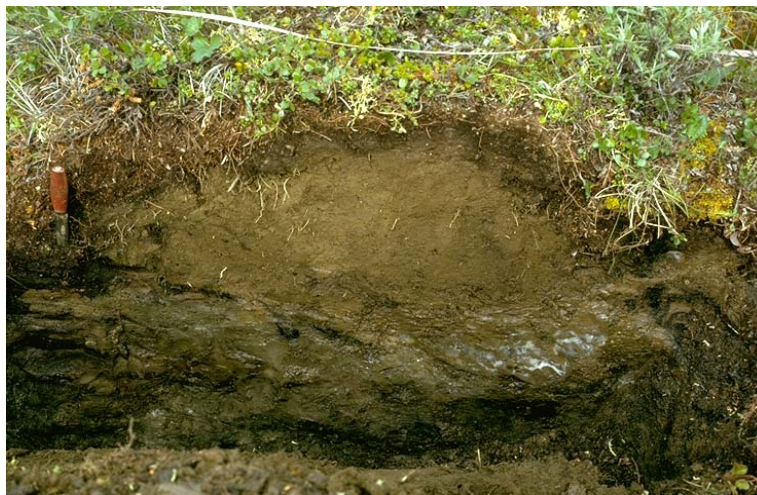
Fig. 2. Example of strongly cryoturbated, perennially frozen, mineral soil (Turbel). This soil is associated with the earth hummock type of patterned ground. It contains large concentrations of cryoturbated organic materials (the black areas) in the subsoil and has a high ice content.